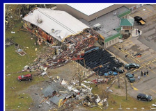
The U.S. leads the world in tornados, averaging over 800 a year.