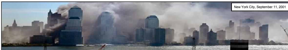
New York City, September 11, 2001

After the events of September 11, 2001 it became clear that our worst dreams could become reality and that we will likely face significant challenges in this new millennium. As we cope with this realization, we find ourselves asking, will we be ready when the next disaster arises? What can I do to help my family, my friends, and my community when that day comes?